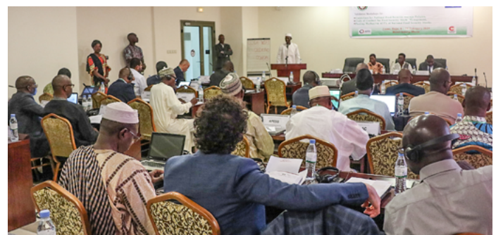
Partial view of the Lomé workshops participants