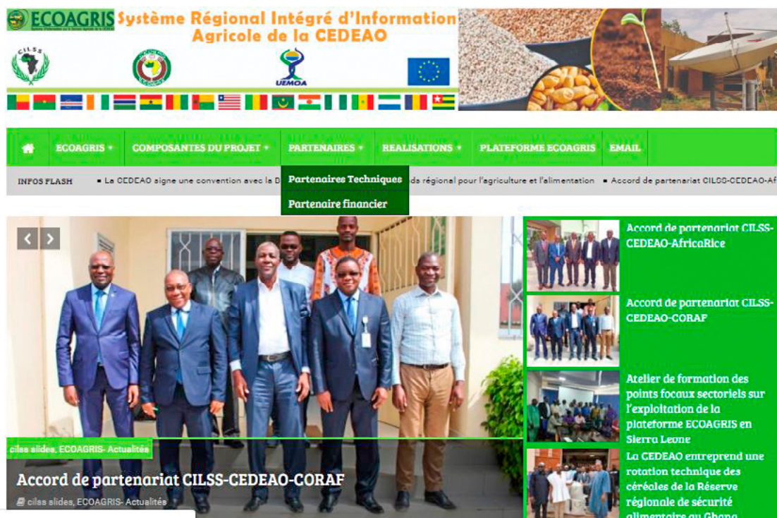
Partial view of the Ecoagris Website

In addition, the Ecoagris website ( http://ecoagris.cilss.int ) is accessible to users. Yet, the completeness, updating and data quality remain strongly dependent on the capacities and performances of national information systems. The platform ( www.ecoagris.net ) has also been developed and relies on twelve (12) thematic information subsystems: early warning systems, agricultural production, livestock, fisheries and aquaculture, agricultural market, agricultural input, research result, agro-hydro-meteo, macro-economy, nutrition, stock, natural resource and climate change.