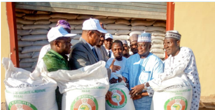
Partial view of the handover of food grains to Nigeria

The decisions of the Ad-hoc Management Committee have allowed to test its intervention procedures (requests from countries, examination / decision-support note by the Stocks-Info Unit, decision by a transitional governance body decided by the TSMC-AEWR. The implementation of the interventions and the experiences feedbacks have contributed to fine-tune the procedures under finalization in the Procedures Manual. The purchase, storage and destocking of food grains as part of the interventions clearly demonstrate that the regional Reserve is truly an instrument of regional solidarity to be consolidated and sustained, hence the importance of accompanying the States in the replenishment operations (deadlines, technical specifications and products quality, etc.).