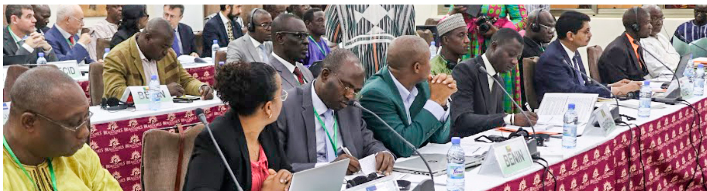
Partial view of the ministerial meeting of Ouagadougou

The year 2018 was critical in the setting-up of the permanent governance instruments of the RFSR with the impetus of the Summit of Heads of State and Government. The TSMC-AEWR June 2018 meeting in Ouagadougou, entirely devoted to the Regional Food Security Reserve, validated the institutional management system of the Reserve.