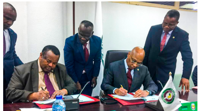
Partial view of the signing of the Convention by the two Presidents

The signing of this Convention on the Management of the Regional Fund between Ecowas and Ebid and the first allocation to the Fund decided by the Ecowas Administration-Finance Board in the Commission's 2019 budget paves the way to the financial mechanism of the regional Reserve under the "food security" window. Though resources remain limited for this first year of 2019, the process is now open.