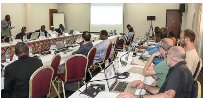
Partial view of the Lomé workshops participants

The region has an updated Inventory of policies, instruments and governance models of stocks in all countries. Countries have put storage back on their agenda with the common objective of ensuring food security for vulnerable populations and a set of objectives that vary according to national situations: the creation of emergency reserves, market regulation and securing profitable markets for producers, etc. The key objective of food security storage policies, namely the securing of supplies, particularly for vulnerable populations, is implemented through a variety of methods including physical stocks, financial reserves, the combination of cash transfers / transfers in kind, social safety nets, etc.