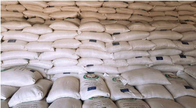
Partial view of the stocks of the Reserve

States benefiting from regional solidarity and stocks rotation are committed at the highest level to replenish the stocks grain-for-grain. For the first replenishment operations, close follow-up and support activities from Ecowas and RAAF are being conducted, including lessons learned to fine-tune the procedures.