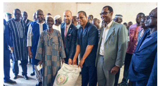
Handover of a bag of maize to a vulnerable peasant in Burkina Faso