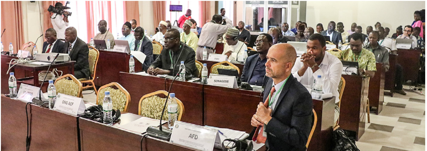
Partial view of the Lomé workshops participants

All these dynamics at the national level will particularly help to move forward in strengthening and pooling national security stocks, pooling human resources and the capacities of national companies as part of the networking of national food security storage companies within Resogest.