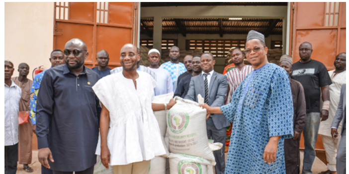
Partial view of the handover of food grains to Ghana

Faced with the difficult food situation of 2018 in several West African countries, the Heads of State and Government of the Community instructed the Ecowas Commission in July 2018 on the necessary mobilization of the regional Reserve - they created in 2013 - to help vulnerable populations. This mobilization, at the highest level, has accelerated the establishment of Reserve governance bodies, particularly the adoption of the Regulation establishing the Management Committee. Statutory bodies have also validated the principle of the replenishment of the stocks "grain-for-grain" by beneficiary countries, and this because of the need to perpetuate the instrument.