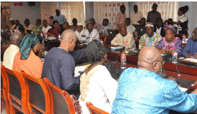
Partial view of the launching of the Information Campaign

The preparation of this campaign is scheduled to end this year to allow the consortium and its partners to interact directly, starting from 2018, with producers' organizations that have been selected.