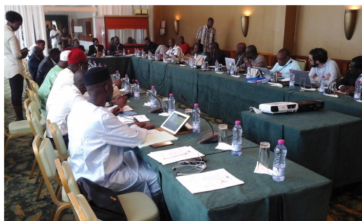
Partial view of the launching of the Study on the Good Practices on Stocks Management

According to the specifications, it is expected that capitalization of experiments will be done in two areas: National Prevention Systems and Management of Food and Nutritional Crises.