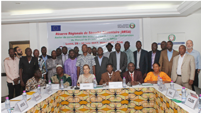
Partial view of the launching of the study on the Manual of Procedures

Participants' views will be considered by the consultant in the final drafting of the Procedures Manual which will be validated at a regional workshop. A ministerial meeting is also planned to deliberate on the Regulation establishing the Regional Food Reserve Management Committee.