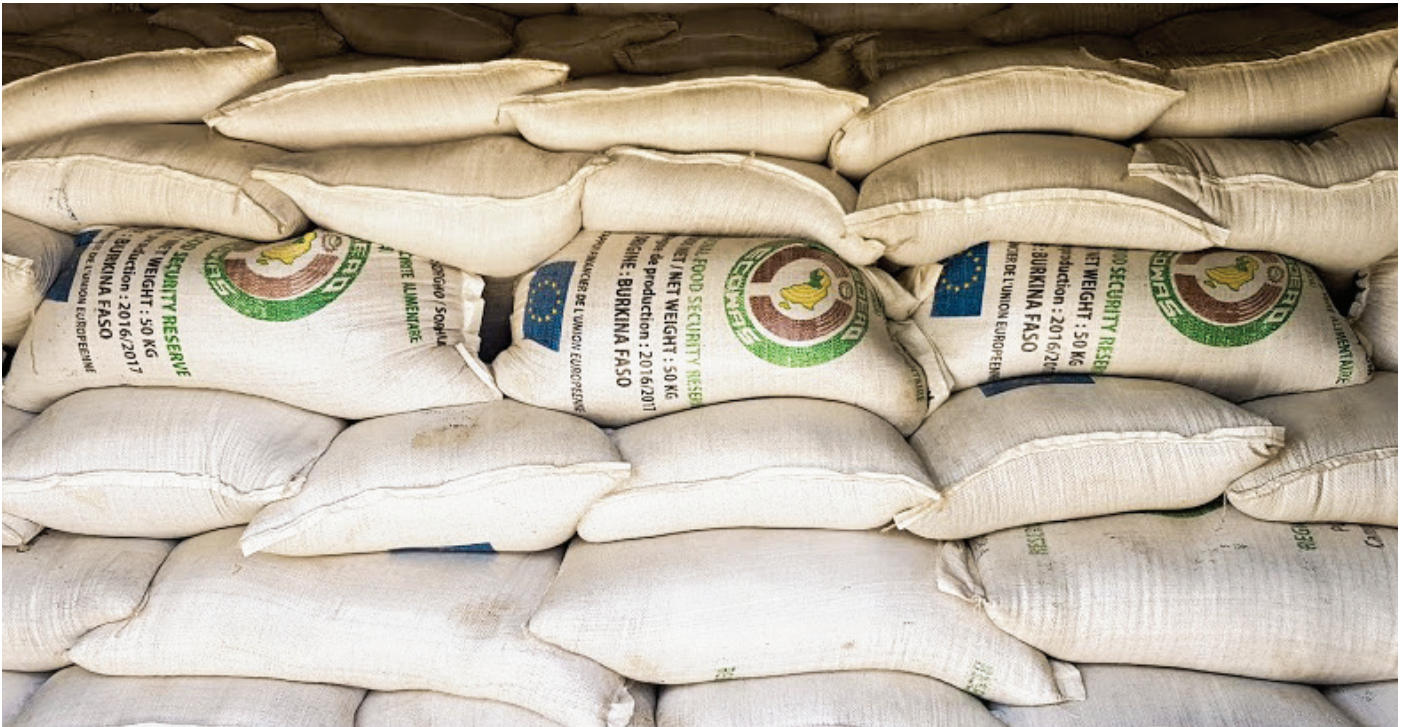
Partial view of the Food Reserve's stocks in Sonagess warehouses, Dedougou, Burkina Faso

With the progressive constitution of the physical stock of the Regional Food Security Reserve, Ecowas is in the process of strengthening its capacity and building the foundation of a structural regional solidarity for food and nutrition security.