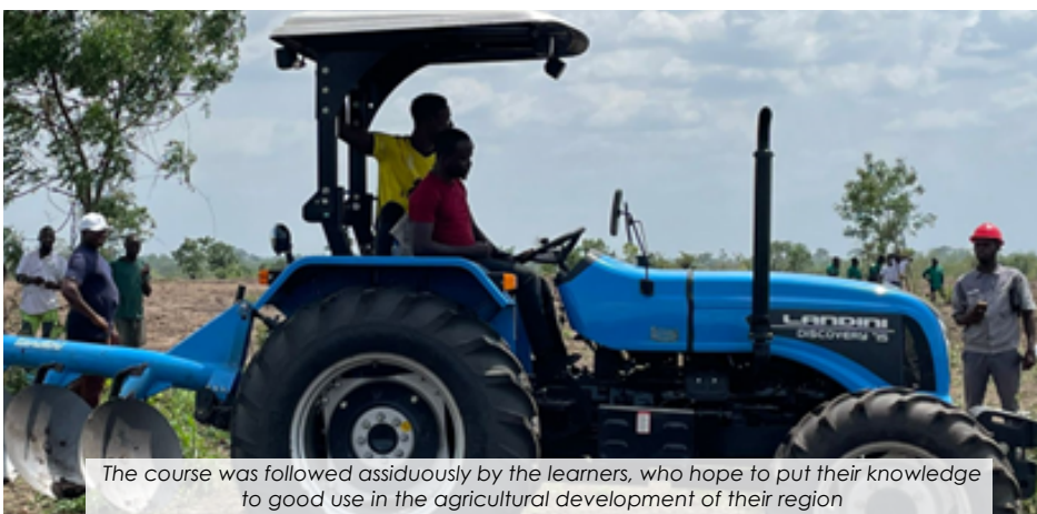
The course was followed assiduously by the learners, who hope to put their knowledge to good use in the agricultural development of their region

There are a total of 120 trainees, including 100 tractor operators and 20 maintenance technicians, all from the "Entreprises Cantonales de Travaux Mécanisés" (ECTM) programme, whose mission is to help increase the rate of mechanisation of cultivation operations... Read more