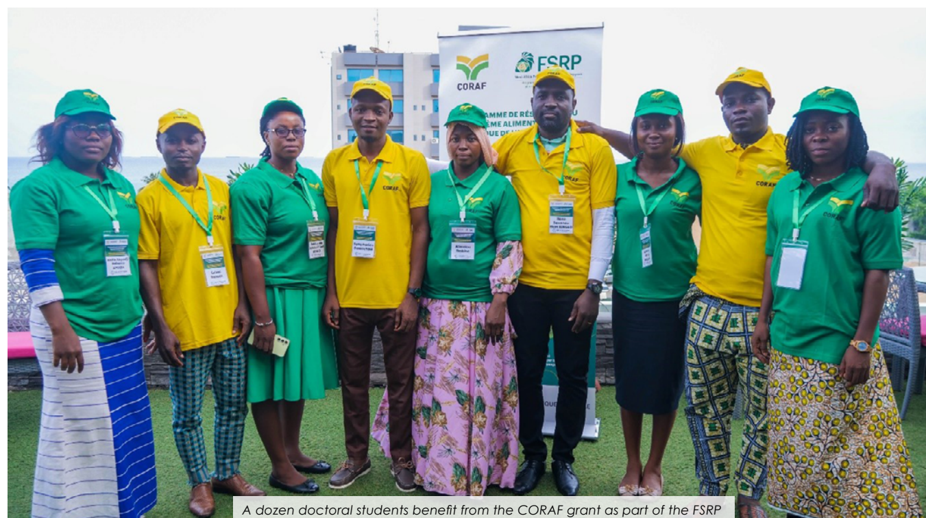
A dozen doctoral students benefit from the CORAF grant as part of the FSRP

Student training is at the heart of the capacity building policy of CORAF, the leader in agricultural research in West and Central Africa. Student scientific days were organised in Togo from 22 to 26 April 2024 to share the results of doctoral and master's theses with CORAF's Scientific and Technical Committee (STC)... Read more