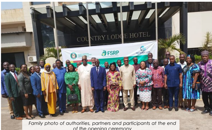
Family photo of authorities, partners and participants at the end of the opening ceremony