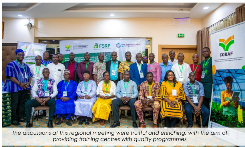
The discussions at this regional meeting were fruitful and enriching, with the aim of providing training centres with quality programmes