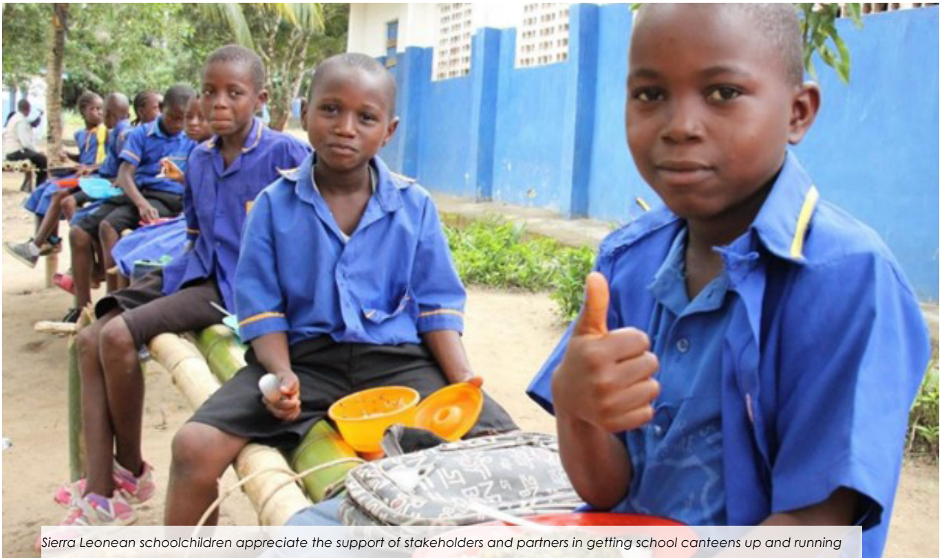
Sierra Leonean schoolchildren appreciate the support of stakeholders and partners in getting school canteens up and running

In Sierra Leone, by the end of 2023, the school feeding programme had benefited more than 114,823 children in 584 pre-primary and primary schools, around 51.5% of whom were girls, with 126 days of feeding completed in all the targeted schools. To achieve this, 1,855.763 tonnes of food were purchased and distributed to 584 schools in the three targeted ... Read more