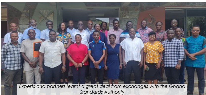
Experts and partners learnt a great deal from exchanges with the Ghana Standards Authority

The West Africa Food System Resilience Programme (FSRP) in conjunction with the Ghana Standards Authority has conducted a first phase of review of Commodity Standards for FSRP's value chain commodities: rice, maize, soya, cowpea and poultry... Read more