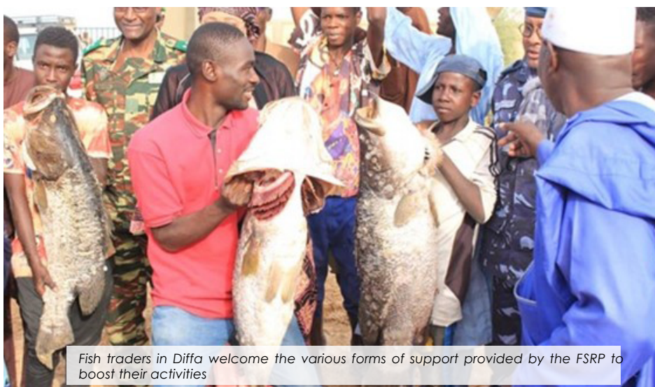
Fish traders in Diffa welcome the various forms of support provided by the FSRP to boost their activities