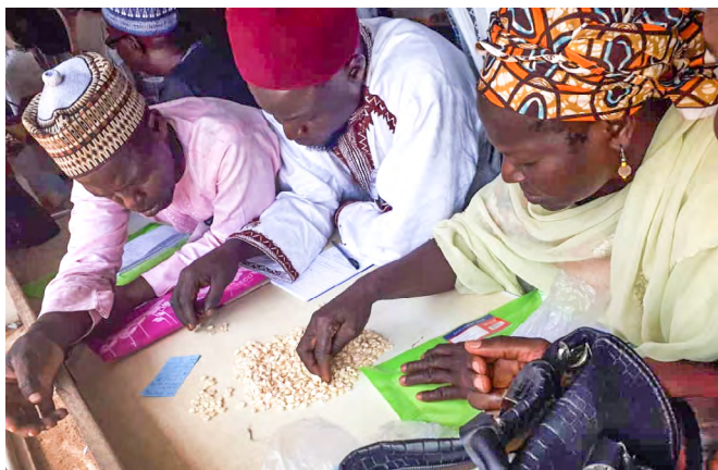
Partial view of the Kaduna trainees exercising in quality control (impurity) on a maize sample

In its effort to structure the demand for cereals and increase the incomes of local producers, ECOWAS clearly indicates that the supply of products for the Regional Reserve must be made primarily through the associations of producers and processors of the region. In addition, by gradually positioning themselves through sustained advocacy and lobbying efforts, POs are more and more at the forefront of the battle for greater access to institutional markets and thus, remind ECOWAS that it must further promote a friendly-environment for investment to drive improvements in local production and processing practices.